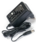
24V 0.8A power adapter