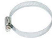
Metal ring (one)

*DIN mount includes four screws to attach it to the back of the device.