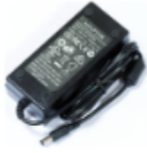
24V 2.5A power adapter