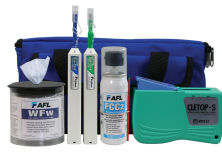
FCP2 Fiber Cleaning Kit for SC/ST/FC/LC